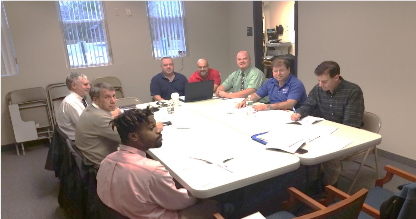
Town of Hopkinton