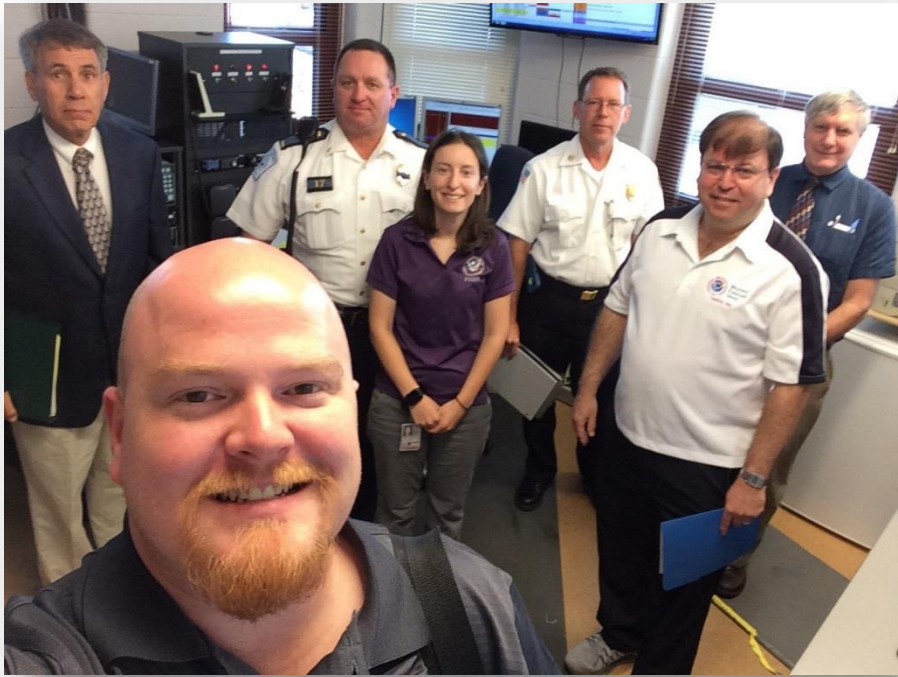
Town of Middletown