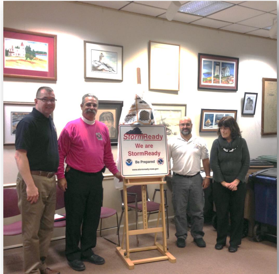
Town of Tiverton