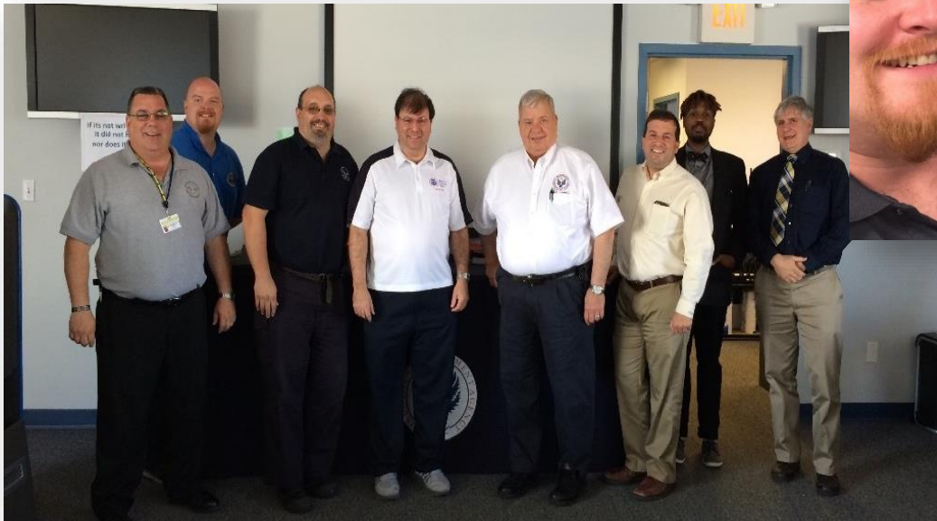
City of Pawtucket