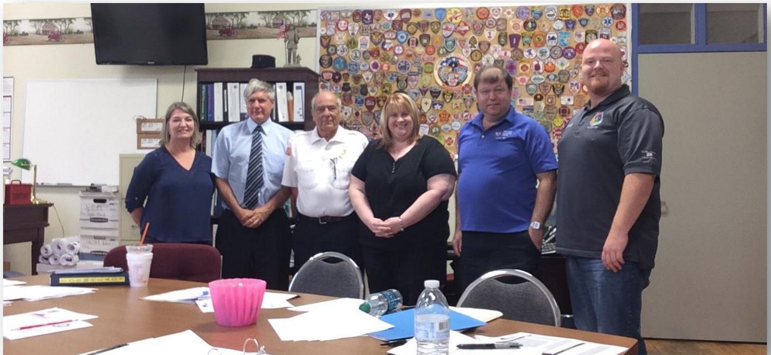
Town of Warren