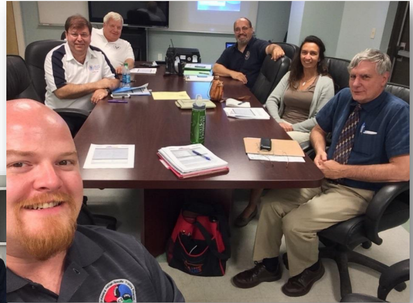
City of Central Falls