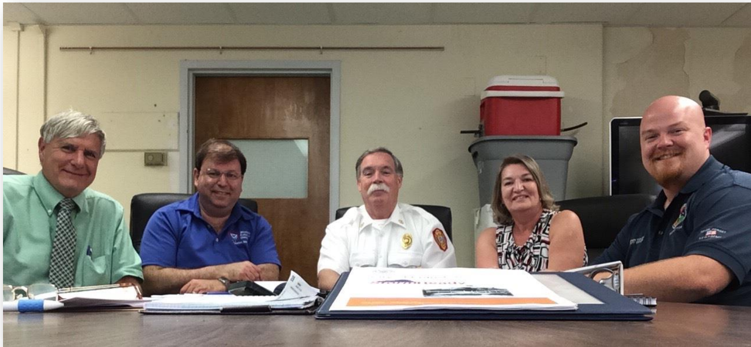
City of Cranston