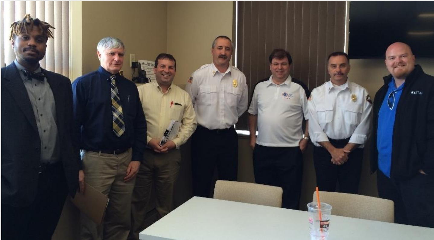
City of Woonsocket