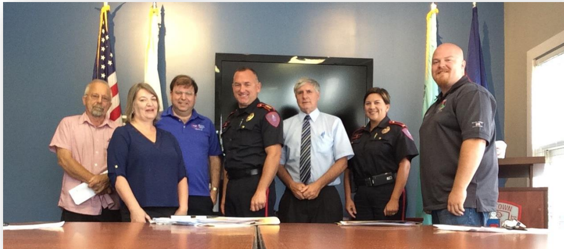
Town of Jamestown