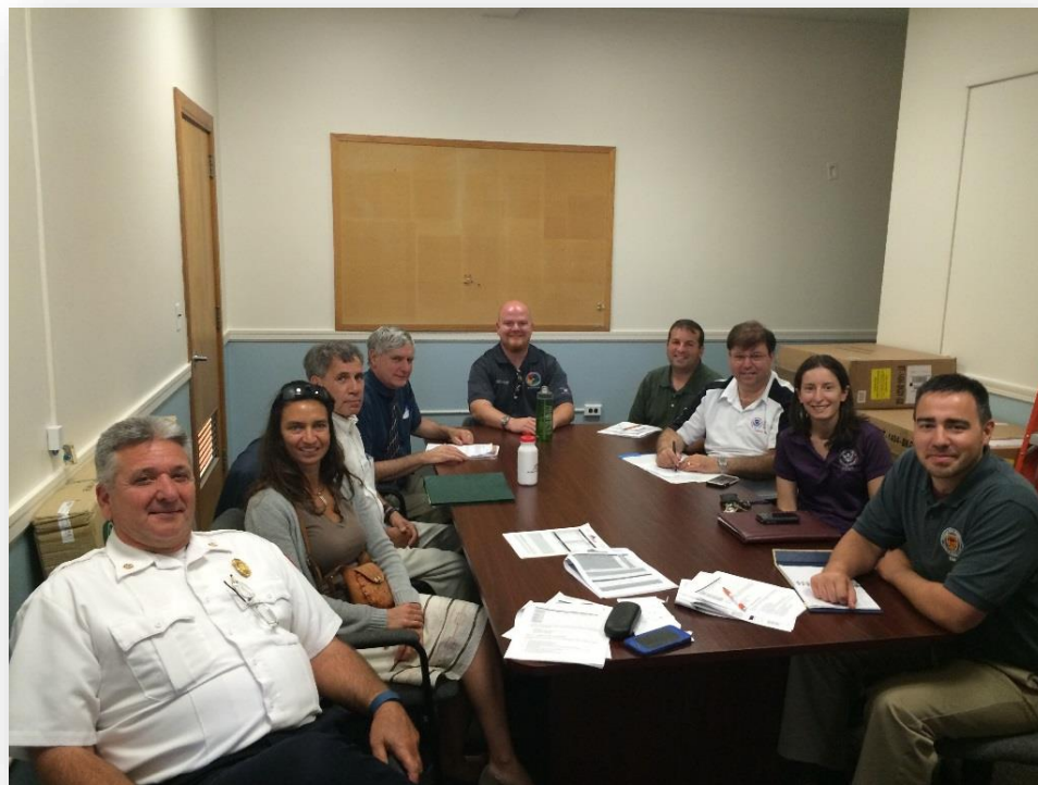
Town of West Warwick