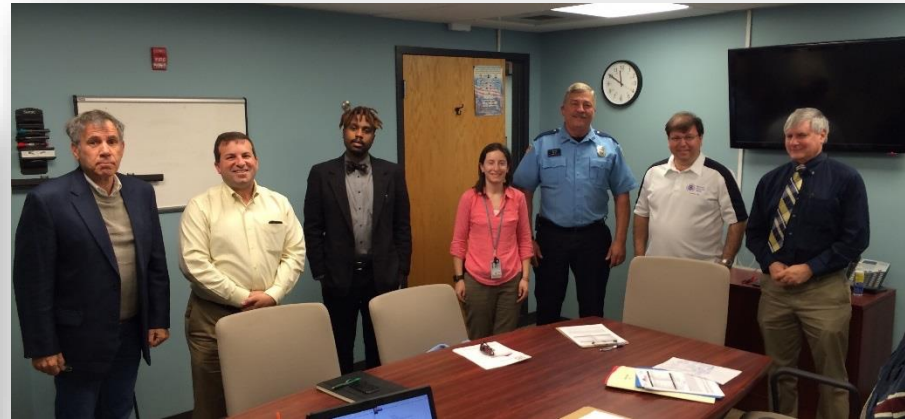
Town of Burrillville