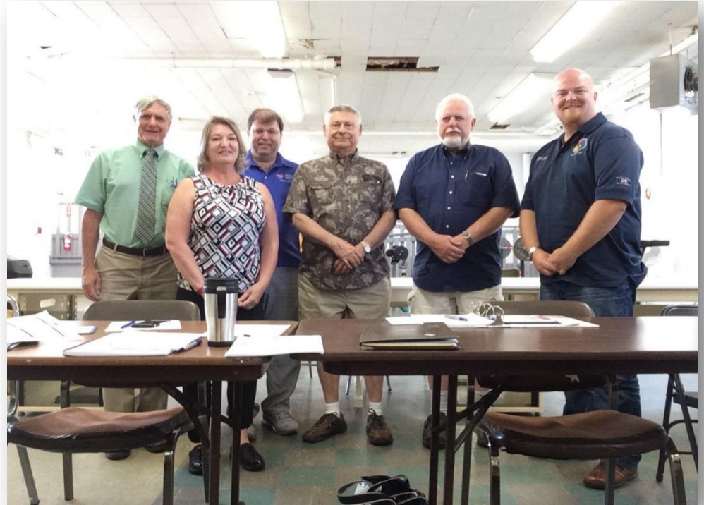
Town of North Smithfield